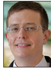
Manzi: Economic outlook better

A recession hasn't materialized, and macroeconomics have been generally favorable for auto retail. Dealers seem encouraged, for the most part.