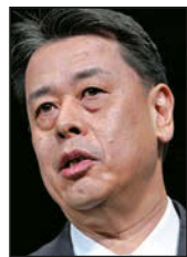
Uchida: "It will take more time."

The strategy is to make U.S. vehicle sales more profitable, introduce eight new U.S. models and make sure dealers are on board with the plan.